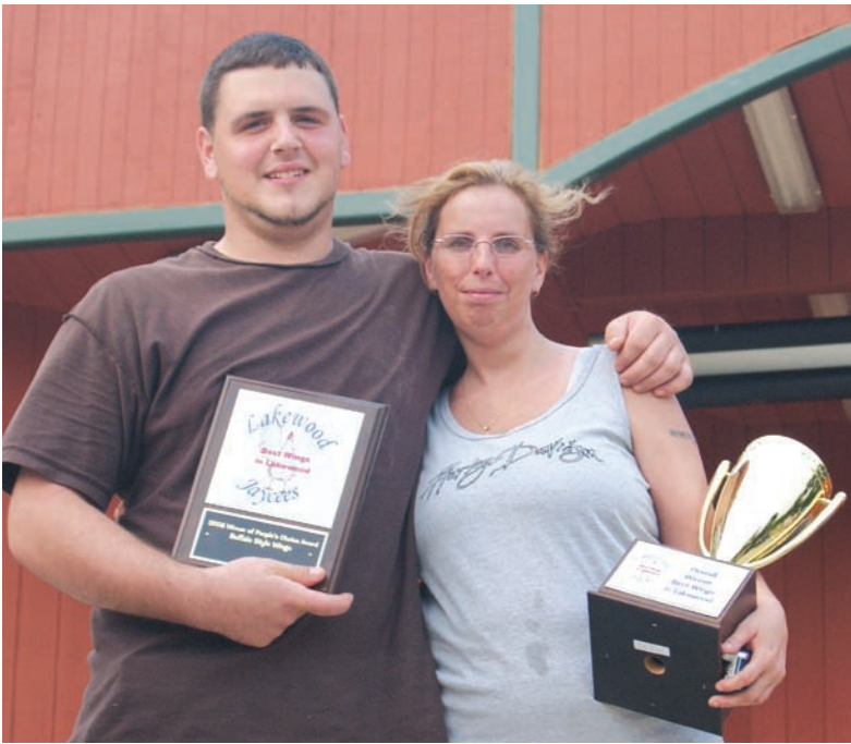
People's Choice "Best Buffalo Style" Wings: Carlucci's