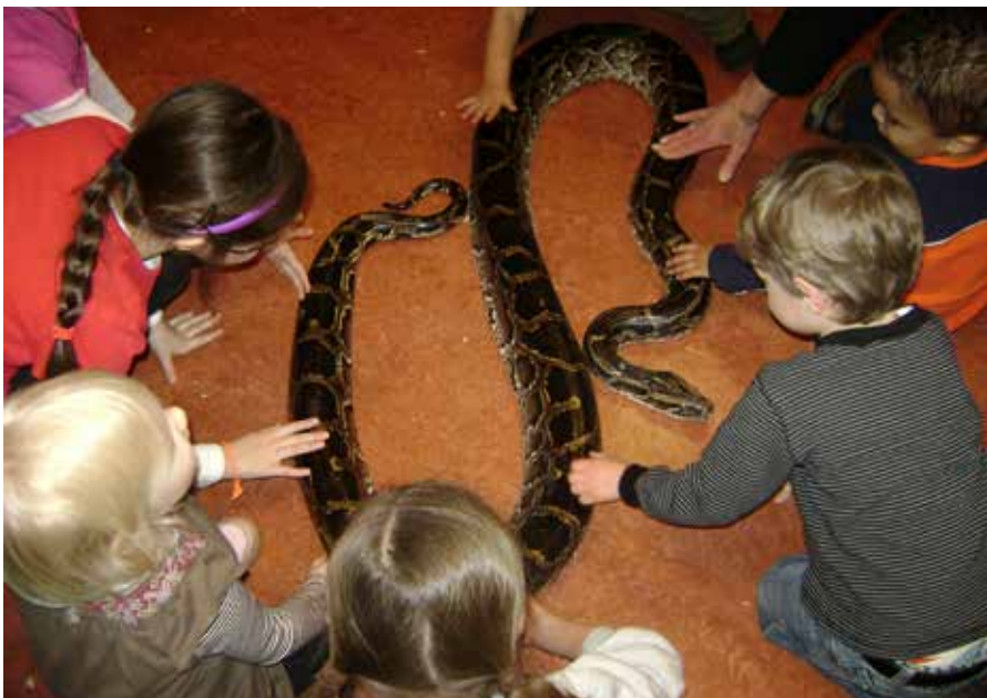
Children pet a snake at a previous show.