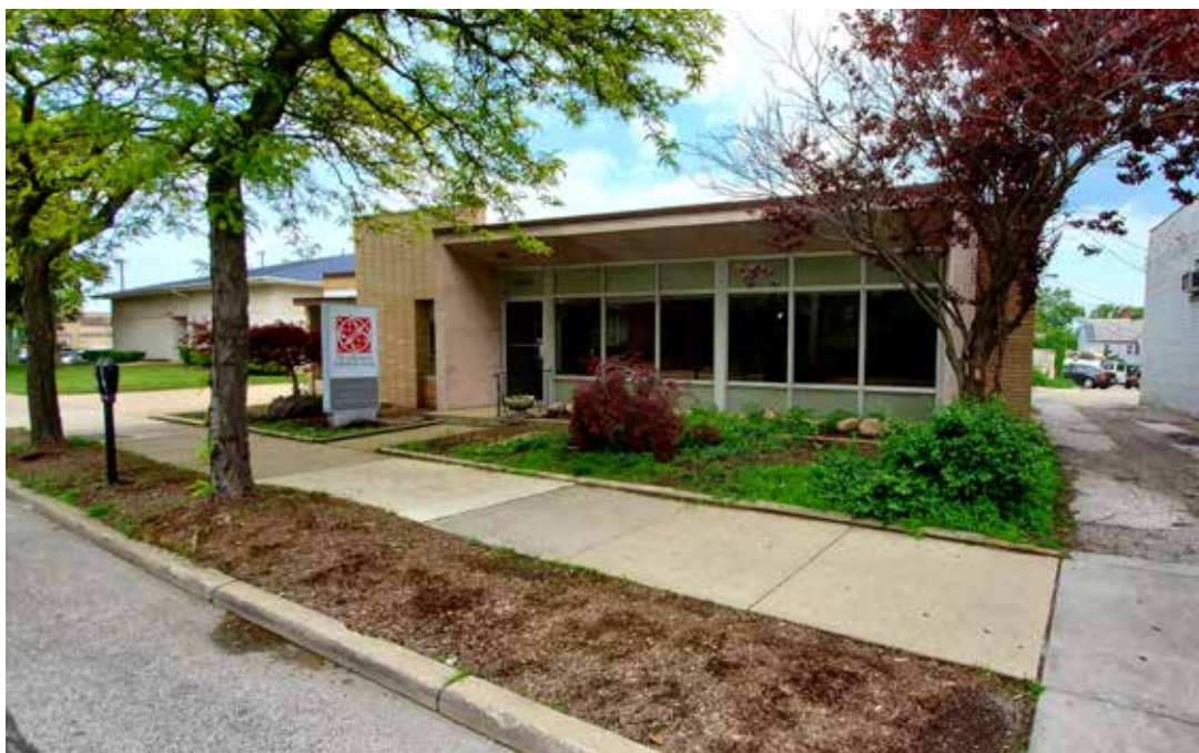
The Haber Family Center for History, 2019. Open to the public Thursday afternoons, 1:00 to 4:00 p.m.