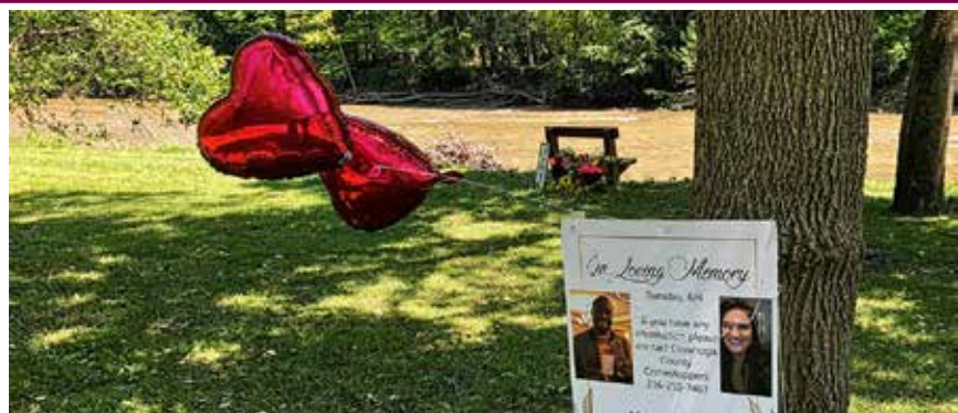
The scene of the double homicide in Metro Parks.