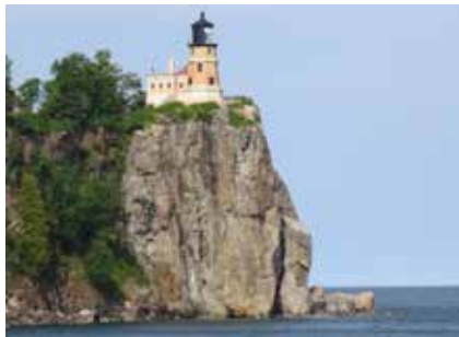
Split Rock Light house overlooking Lake Superior.