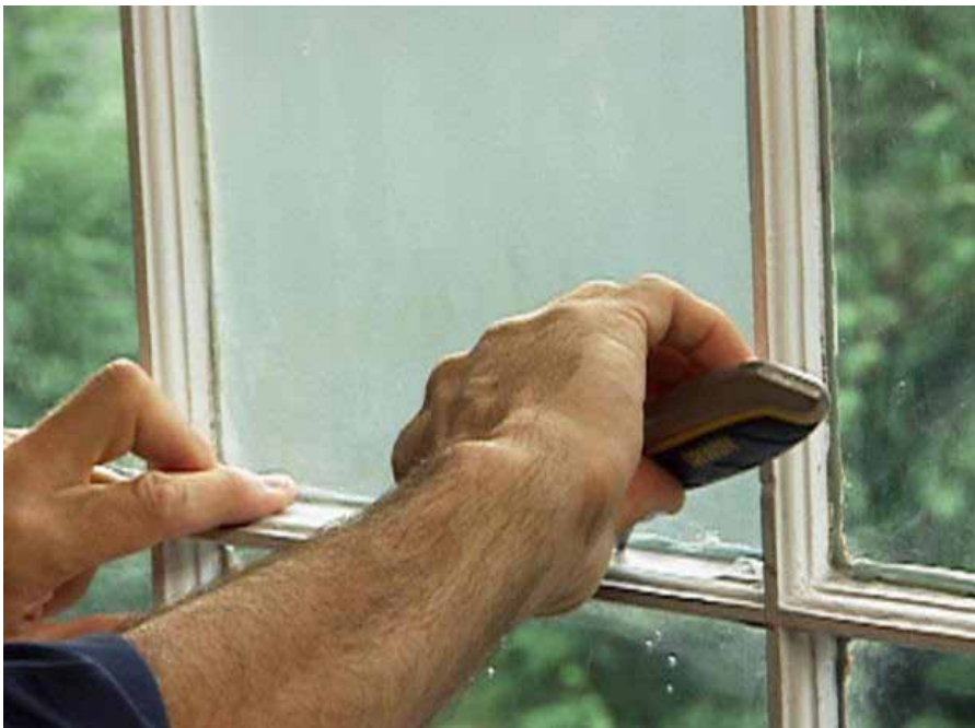
LakewoodAlive’s “Knowing Your Home: Weatherization Basics” Workshop takes place September 14th.

events, we are asking participants to consider either making a donation to LakewoodAlive or bringing canned foods or other non-perishable items for donation to the Lakewood Community Services Center. We appreciate your support.