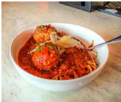
Meatballs, they were just great!

Do you need legal help related to your license suspension? Legal Aid may be able to assist you. Visit lasclev.org/contact to learn more.\