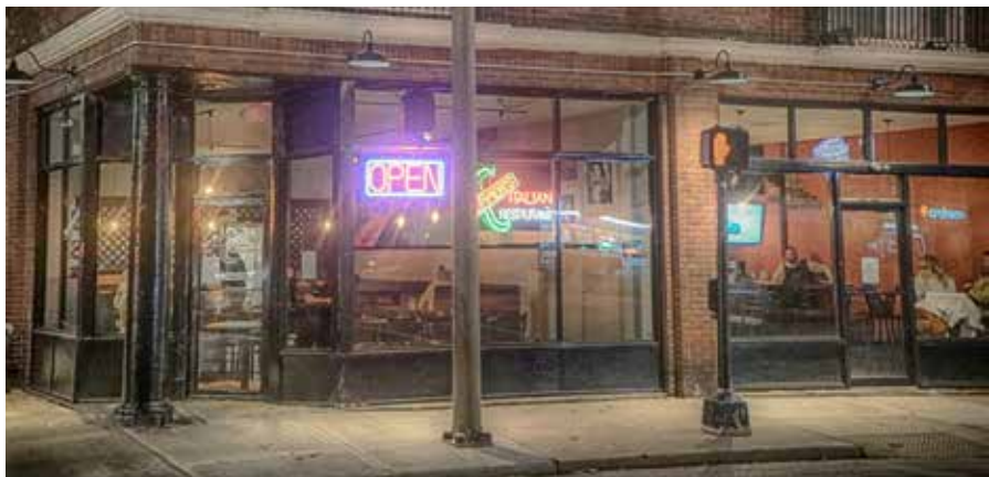
One of Lakewood's romantic hot spots reopens.

Open Tues -Sun 4-9 with a fresh new look and brand new wine bar.