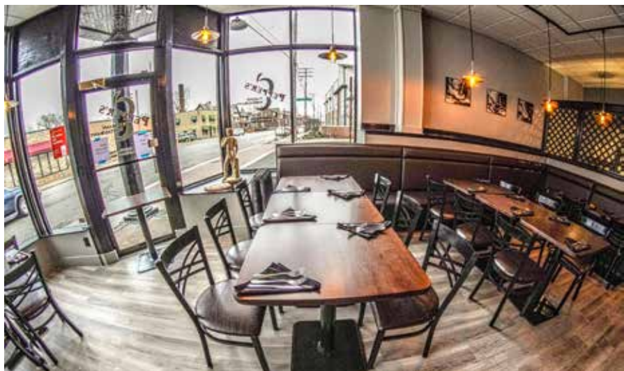
Same great food, but more room for all!