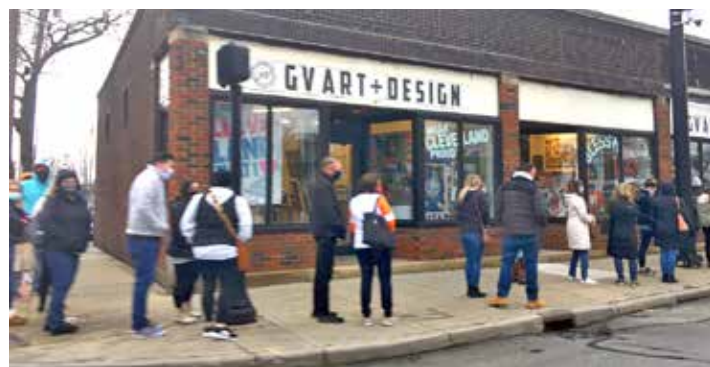
As with most play-offs, the line at GV Arts is around the corner!