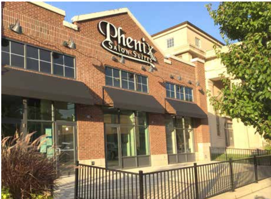
15314 Detroit Avenue

Most of the salons operate by appointment but same day appointments can often be accommodated. The best way to learn about the various services and salon owners is to visit the Phenix website at www.phenixsalonslakewood.com . Online booking is available for many of the salons.