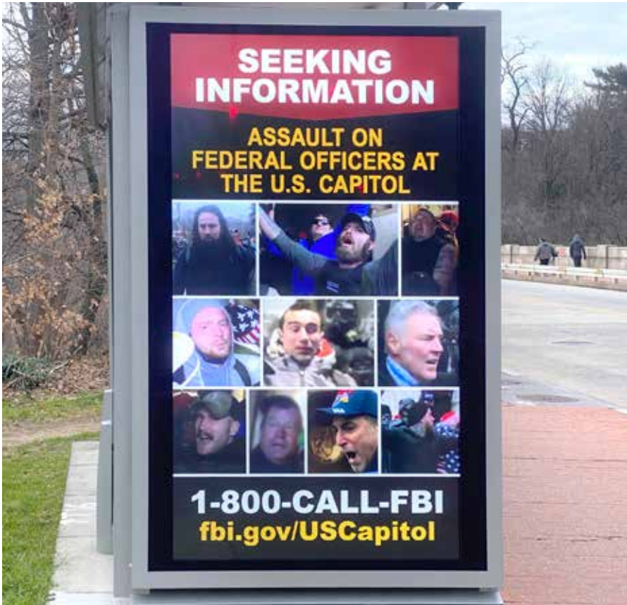
A bus stop in Washington D.C. January 16.

There are currently two vaccines that have received emergency use authorization from the FDA: Pfizer/BioNTech and Moderna. Both vaccines involve two injections, given 21 (Pfizer) and 28 (Moderna) days apart. I found the following articles helpful in explaining how the vaccines work, who should get the vaccine (e.g., children? pregnant women? people with prior infection?), and what you can expect after each dose: https://www.mayoclinic.org/diseases-conditions/coronavirus/in-depth/coronavirus-vaccine/art-20484859 and https://www.nytimes.com/interactive/2020/health/pfizer-biontech-covid-19-vaccine.html . I am encouraged that the vaccines are becoming available to the public, and I plan to get vaccinated as soon as I am eligible.