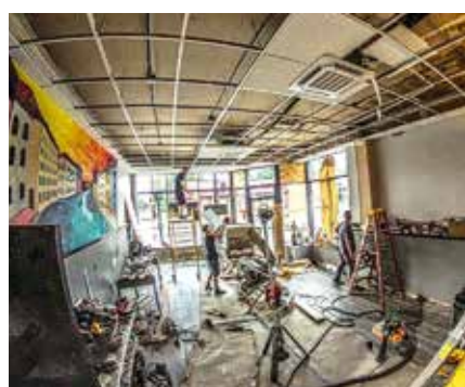
Joey gutted the old place.