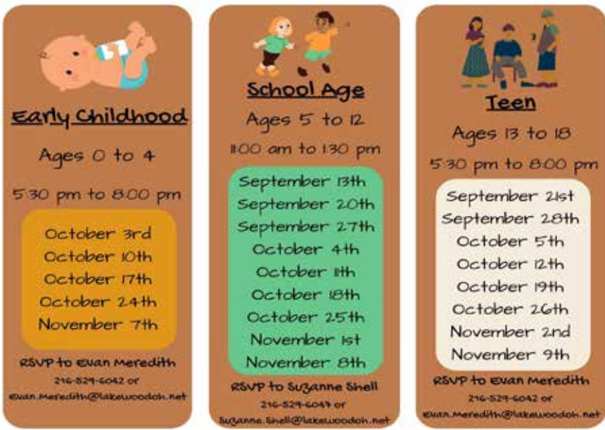
Active Parenting Classes.