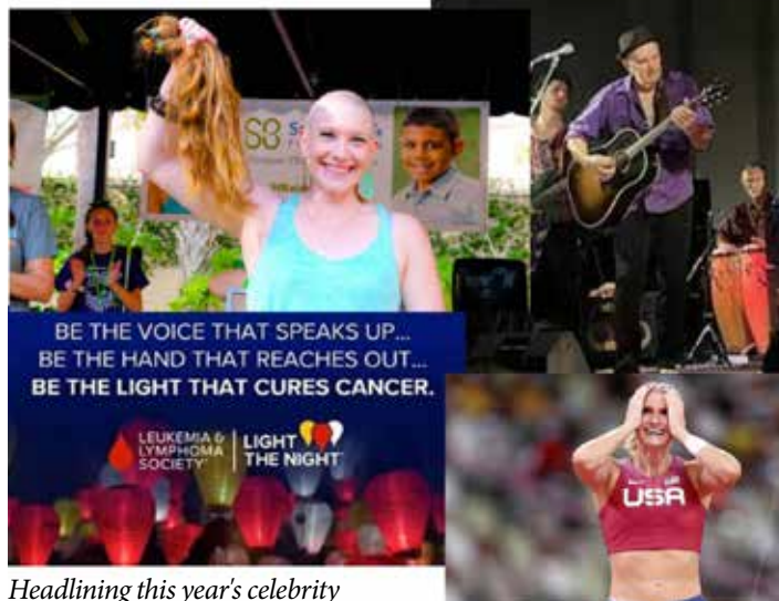
Headlining this year's celebrity bartenders is Olympic Gold Medal Pole Vaultist, Katie Nageotte, of the Lakewood Nageottes