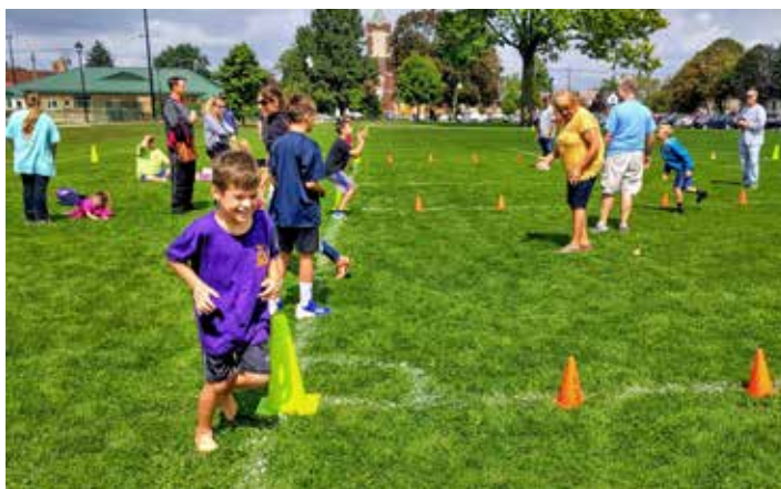
The Lakewood Community Festival features fun and games, and prizes for kids of all ages.

urday, September 10, 2022 at Madison Park, 13029 Madison Avenue. The day of fun and activities for the entire family will take place from 11 a.m. to