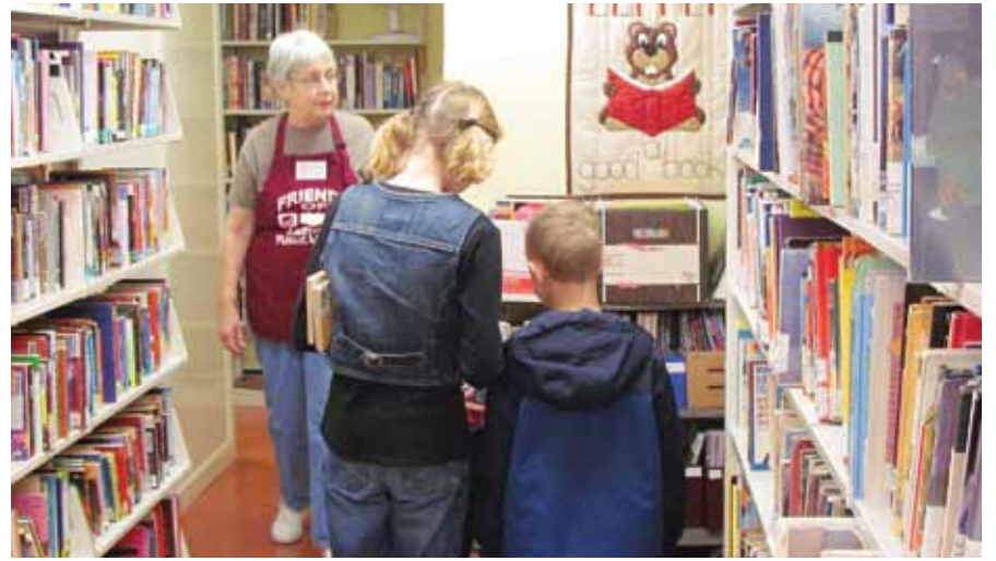
There's always a great summer read to be found at the Arts Festival Book Sale at LPL!